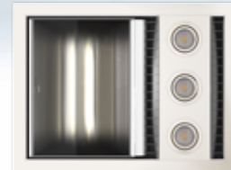
Tastic Neo Single Remote Control 31211 White 31212 Silver