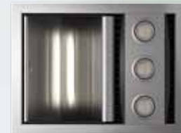
Tastic Neo Single Hardwired 31111 White 31112 Silver