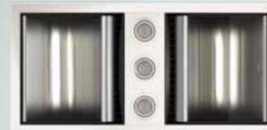
Tastic Neo Dual Hardwired 32111 White 32112 Silver