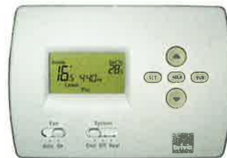
Suitable for Bravis ICE Add-on refrigerated cooling system with Bravis Classic heaters.

The Bravis Programmable Controller can operate in either auto or manual modes. In auto mode you preset temperatures and times for the heating/cooling system to turn on and off. Alternatively the manual mode allows you to turn the heating/cooling system on or off as desired.