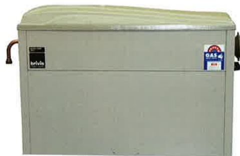
Brivis HX - Outdoor Unit

The Brivis StarPro PLUS medium efficiency range employs all of the great features and benefits of the Brivis StarPro MAX range, but at a medium efficiency star rating. The Brivis StarPro PLUS series has an efficiency range from 4.2 stars to 4.4 stars.