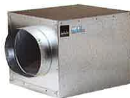
The Brivis ICE Add-on refrigerated cooling system series indoor coil unit is incorporated into your heating ductwork