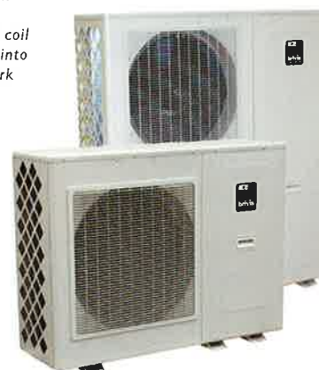
Brivis ICE Add-on refrigerated cooling system outdoor units