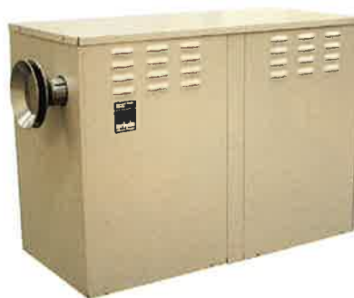
Brivis Compact PLUS CMX (External application)