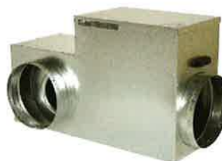
Brivis HX and MX - Indoor Unit

The Brivis StarPro series of heaters feature a spark ignition system to ignite the burners. A flame sensor on the end of the burners sends a signal to confirm that there is ignition across the entire burner. The gas ramps up to maximum to quickly heat up the heat exchanger, the circulation fan starts slowly, and gently ramps to the optimum speed for heating the house. This ensures that the start up of the heater is extremely quiet, delivers heat in the fastest possible time and that you don't feel a cold draught when the fan starts.