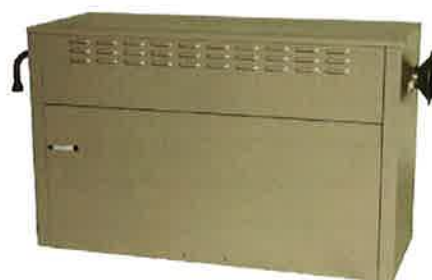
Brivis MX - Outdoor Unit

The technologies used in the Brivis StarPro series are a culmination of Brivis' 50 years of heating experience in Australia. The Brivis StarPro series features ensure that the heaters are more effective at heating your home, with the least amount of energy and expense. Every aspect of the Brivis StarPro series has been designed to make it more powerful, efficient, reliable, and unobtrusive.