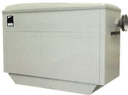
Brivis StarPro B-MAX*

If you are one of the thousands of Australians who have enjoyed the performance and reliability of one of Australia's highest selling ducted gas heaters, the Brivis Buffalo, you can now upgrade to the High Efficiency Brivis B-MAX simply, quickly and economically.